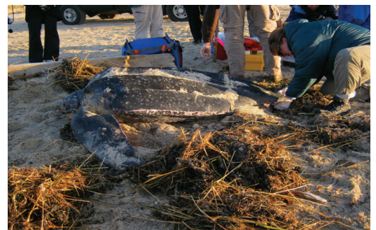
Leatherback Sea Turtle, stranded in early Nov. at Crowes Pasture.