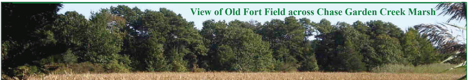
View of Old Fort Field across Chase Garden Creek Marsh

In this upcoming year DCT's Recognition Committee plans to replace all the memorial plaques that have been damaged due to weather or other related issues, with new plaques. The Committee feels it important to remember those who have given so much to DCT over the years.