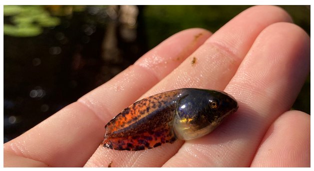
A grey tree frog tadpole.

How did it get here? I knew from my years living in New Zealand that eels can travel overland in the right, wet forest conditions. Adult eels will traverse land in search of better freshwater conditions for growth or during spawning runs to sea. But for a baby eel, overland travel is no small feat. I walked around the plash again and found no obvious hydrological connections. I scoured mapping resources, and still found nothing. The mystery remains.