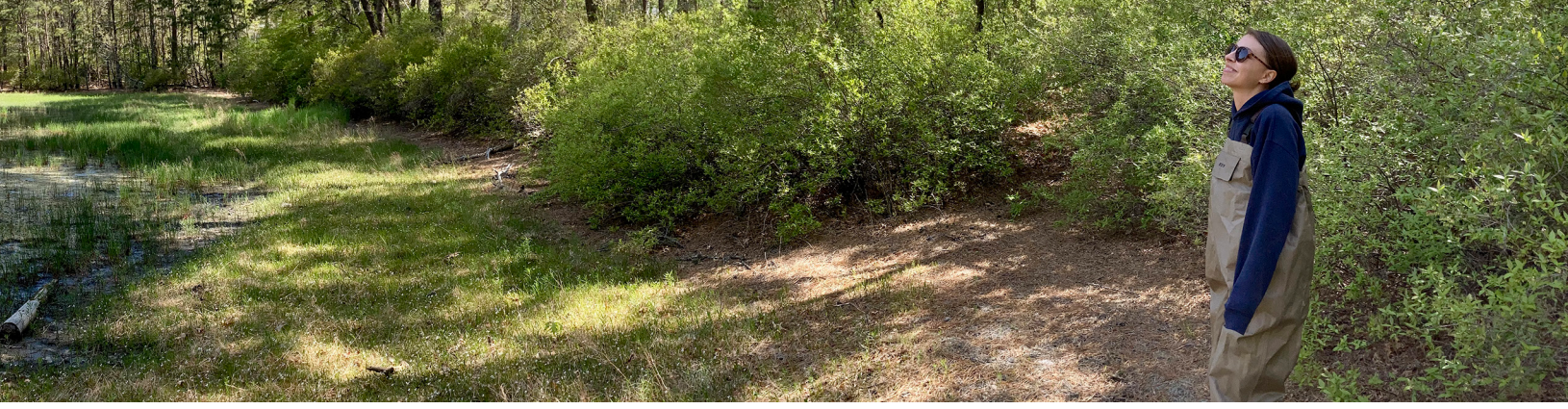
DLCT's Apple Tree Pool property

For example, river herring start their lives in a freshwater pond or river, and grow through summer before leaving for the ocean. There, if lucky, herring survive for several years before maturing and returning to the same or a nearby pond or river to spawn, carrying in them a chemical concoction derived from sustenance at sea.