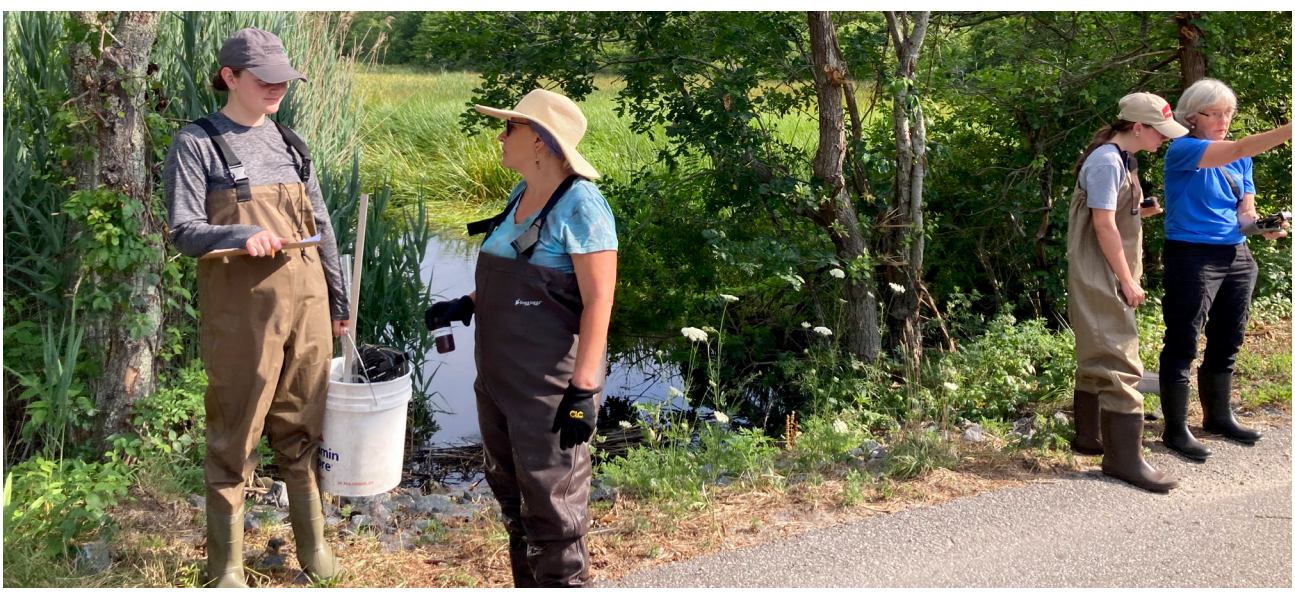
The team samples the middle Creek by New Boston Road

My summer was full of so many new and different experiences. Grant and report reading and writing, brochure design, data collection, coding - the list goes on! Not all internships give college students such a diverse array of tasks and I feel extremely fortunate to have worked with DCLT. Internships, at the end of the day, are about learning something new. Despite the pressure to decide on a major or career path in college, people my age rarely - if ever - know exactly what they want to do with their lives, and COVID made that especially difficult! Regardless of whether I continue to do nonprofit work in the future, I know that my time with DCLT gave me so many new experiences and skills to draw on as I continue to explore my interests. Who knows what next summer will bring?