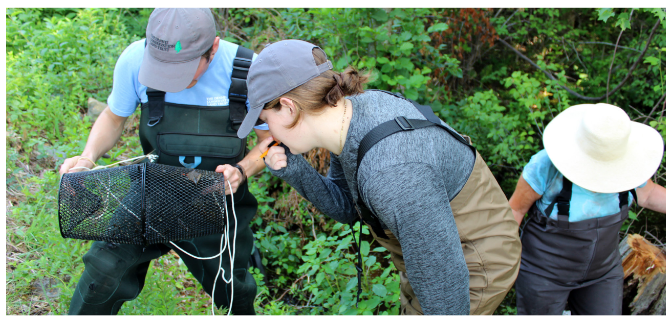
Sampling the upper Creek by Howes Pasture.

When COVID first hit in March of 2020 during my senior year of high school, my peers and I were left feeling directionless. I remember sitting in my kitchen with my mom as we got the news that we'd get a two-week extended vacation, which quickly turned into a month, and then turned into the rest of the year being virtual. The stress and sadness and uncertainty of that time as a student was constant. Not to mention that the pandemic overlapped with the release of college decisions, pushing students to make decisions about our futures when we had no possible way of knowing what the world would look like the next week, let alone in the fall, or four years ahead.