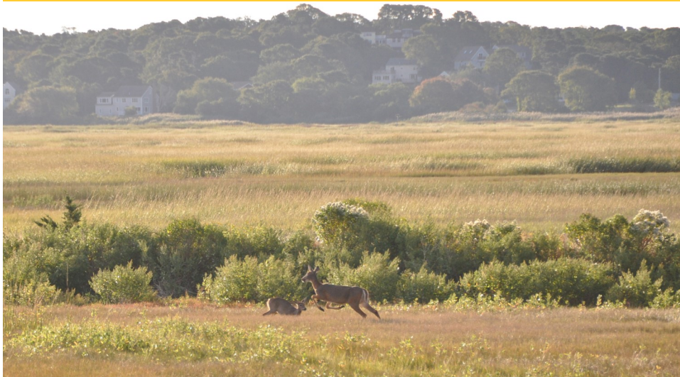
Deer frolicking at Crowes Pasture Conservation Area

With your financial support at any level, the DCT will confidently embark on the next 30 years with its mission to further preserve the natural beauty of our town. Join or renew your membership online at www.DennisConservationTrust.org or mail your check to DCT at P.O. Box 67, East Dennis, MA 02641.