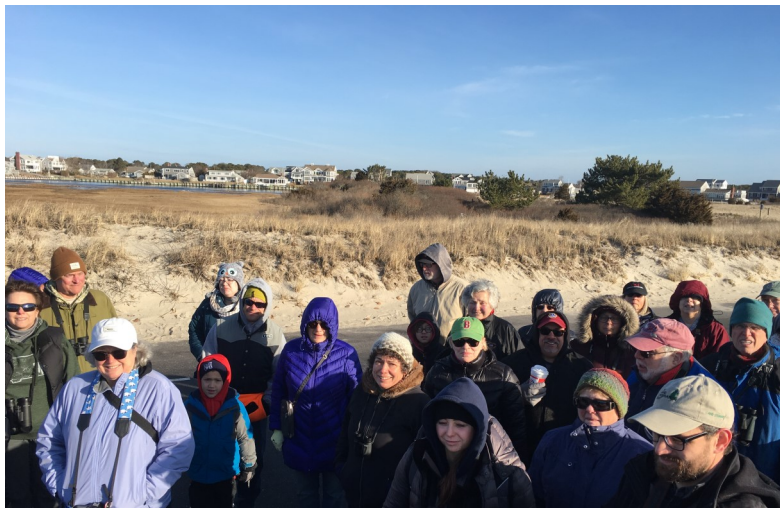
Attendees of the Snowy Owl Walk in January 2018.

Thankful Hike November 24, 2018 at 10 AM Indian Lands Conservation Area