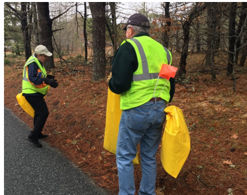
Volunteers at last year's clean-up.

Grab your friends and meet us at Johnny Kelley Park in South Dennis at 9:30am to begin the cleanup and then return to the park at noon for a well-deserved celebration. Online registration is available at www.dennisconservationtrust.org . If you have any questions please don't hesitate to call us at (508) 694-7812.