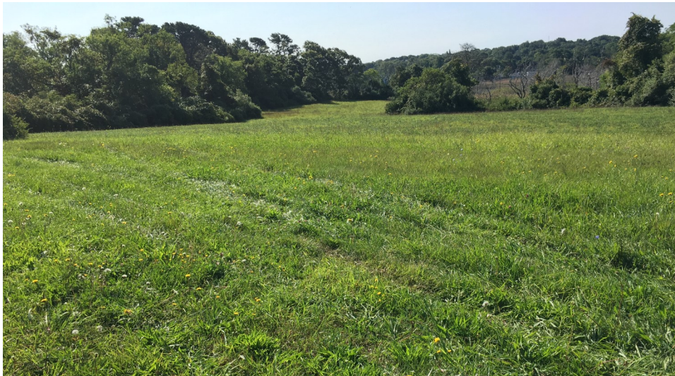
Twenty two acres of privately-owned land on which the DCT holds a conservation restriction. This landscape will remain open forever.