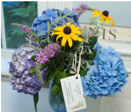
Susie’s beautiful arrangements

Susie says, “Conservation efforts work best when you approach them with good intentions and people listen.” Today she says she worries about our water quality, the safety of our migrating whales, and beach erosion.