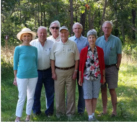
Some DCT Trustees at Grassy Pond

This year marks the 30 th anniversary of The Dennis Conservation Trust.