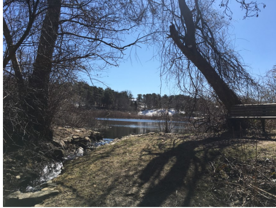
Bound Brook Reservoir

CD: The Quivet Creek Watershed provides unlimited opportunities for exploration. Our favorite spots within this watershed include the Bound Brook Conservation Area, Quivet creek estuary and salt marsh, and the Crowe's Pasture Conservation Area. We can experience fresh water ponds, tidal creeks, pitch pine forests, and beaches within a short distance. Very few places offer so many different opportunities for recreation, exploration, adventure, and education.