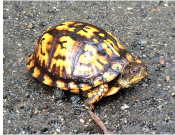
Eastern Box Turtle on DCT land

One might wonder, what is land stewardship? In the nature writing classic, A Sand County Almanac , naturalist Aldo Leopold espouses a Land Ethic, a set of moral values to care for the land, which originates from the inseparable relationship between humans and their natural environments. I believe land stewardship is essentially defined by the following quote from Leopold: