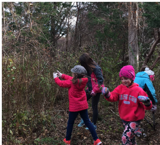
Local Scouts at Old Fort Field