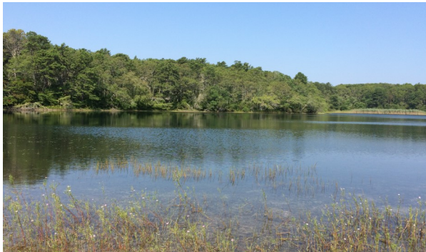
Eagle Pond in South Dennis

This event was made possible by donations from the Dennis Conservation Trust, Town of Dennis Natural Resource Department, Dunkin' Donuts, Dennis Public Market,