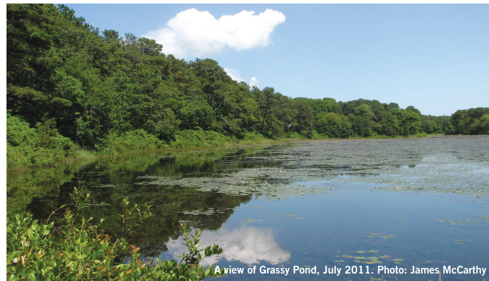
A view of Grassy Pond, July 2011.

In December of 2010, DCT embarked on a collaborative mission with the Town of Dennis to preserve the pristine 11-acre property bordering Grassy and Clay ponds off Setucket Road in South Dennis. This critical natural habitat is densely forested with a mix of pine and oak uplands, and offers serene wooded trails sloping gently down to unique pondfront wetland areas along nearly 1200 feet of shoreline. Connecting to 250 acres of protected open space, the Grassy Pond Woodlands is one of the few remaining large, unprotected, developable parcels of land in Town.