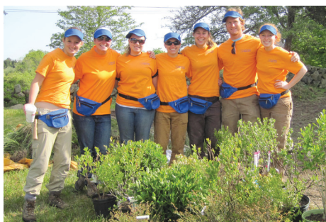
The work would not have been possible without the help of several local school groups, the Cape Cod Bird Club, and many volunteers.