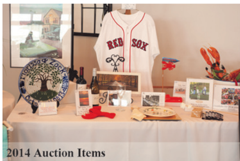
2014 Auction Items