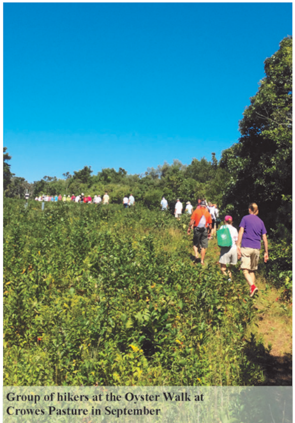
Group of hikers at the Oyster Walk at Crowes Pasture in September