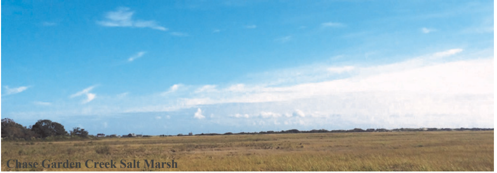
Chase Garden Creek Salt Marsh

A private 501(C)(3) non-profit land trust