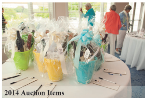
2014 Auction Items