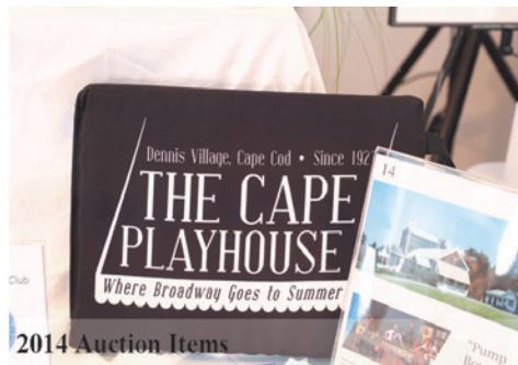
2014 Auction Items

Cape Abilities Farm Cape Air/Nantucket Airlines Cape Cinema Cape Cod Body & Soul Cape Cod Computer Doctor Cape Cod Cranberry Harvest Cape Cod Five Cent Savings Bank Cape Cod Museum of Art Cape Cod Museum of Natural History Cape Cod Symphony Cape Cod Waterways Cape Kayaking Cape Playhouse Chapin's Fish & Chips Chapin's Restaurant Chatham Bar's Inn Chatham Chorale