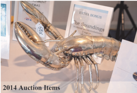
2014 Auction Items

Ocean Edge Resort & Golf Club Ocean House Restaurant Odile Old South Dennis Village Assoc. Original Seafood The Oyster Company Paradise Pizza Pirate's Cove Mini Golf Pool & Patio Quan's Kitchen Quivet Cellars Quivet Neck Homeowners Red Cottage Restaurant The Red Pheasant Restaurant Ring Brothers Riverway Lobster House Ross Coppelman Goldsmith Route 134 Auto Care Royal Pizza II Sailing Cow Café Sayan Collection Scargo Café Scargo Pottery