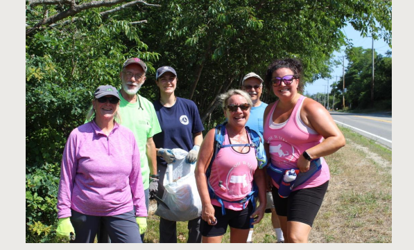
Tuesday, April 12th at 10 AM

Coles Pond at Crowes Pasture Conservation Area, East Dennis