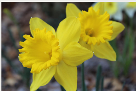
Daffodils in Spring