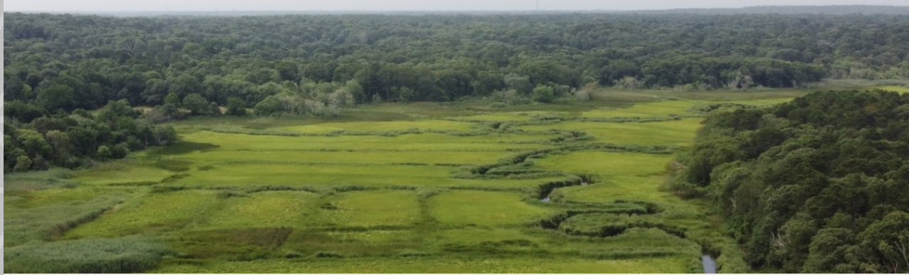
Chase Garden Creek looking towards Tobey West