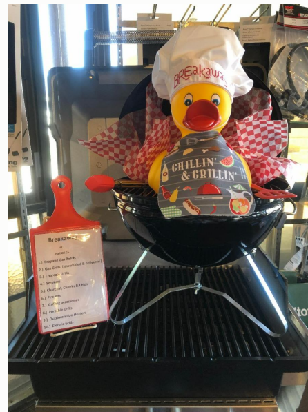
Above: Breakaway/Hall Oil's decked-out duck!

Consider packing a lawn chair, and remember, this is a cash/check only event! See you there!