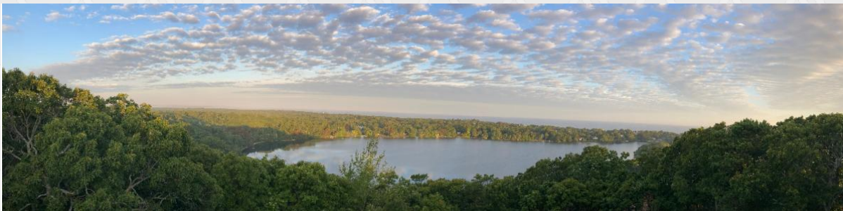
Above: Scargo Lake viewed from its namesake tower.