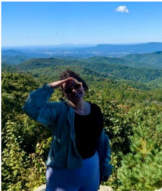
at Shenandoah Valley National Park, VA.

My work life has been, in a word... diverse! I have explored childcare, food service, public health, emergency medicine, and yoga instruction. Currently, I am working as a veterinary scribe in an ER, in hopes of gaining more experience in the field, should vet school be on the horizon.