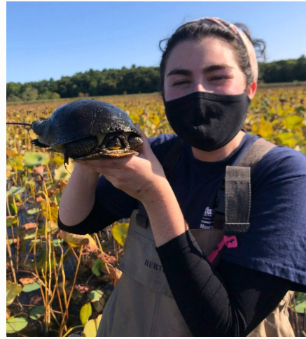
with a Blanding's Turtle tracked via radiotelemetry in Concord, MA.

Inspired, I moved to Massachusetts to pursue my MS in Conservation Medicine at Tufts University, a degree focused on the intersections between environmental, wildlife, and human health. My master's thesis examined the ways in which historic and systemic oppression results in minority groups being disproportionately impacted by environmental issues, and constructed an intersectional framework for which conservation issues should be approached.