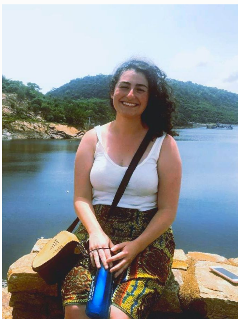
Lake Volta's Akosombo Dam, Ghana.