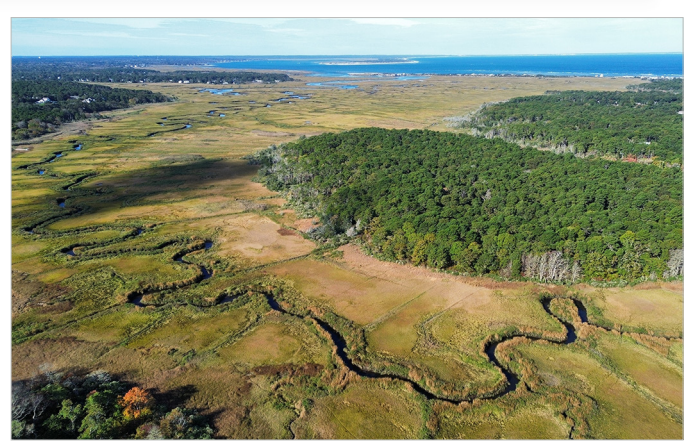
Simpkins Neck (right) on Chase Garden Creek, owned by DCLT and the town

The acquisition this year of our headquarters at Not Enough Acres Farm revives the breadth of our founders' vision. As soon as we moved into the property in July, our "Environmental Study Center" came to life. Out front, the Cape Cod Mosquito Control Project tested a novel trap for nuisance deerflies. In back, a member kept beehives as he sought to learn the craft. Our DY High School interns used the barn to run experiments for the coming science fair, and downstairs, in the new