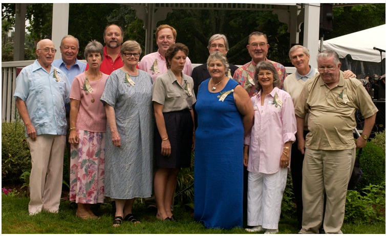
DCLT's Trustees at the Annual Auction in 2004

others who share common values in preserving land, nature, and our community's quality of life."