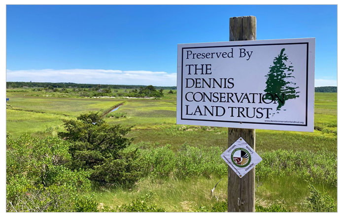
DCLT's 205-acre Black Flats Property, donated in 1994

Through the early 90s, several parcels of land were donated outright to the Trust, including some of the largest properties we now protect through ownership. Thirty-seven acres of land were gifted on either side of Fresh Pond, the second largest