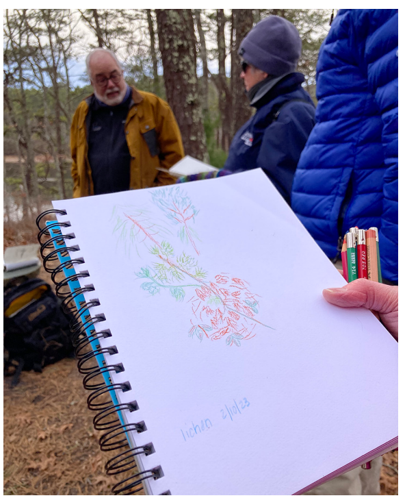
Field sketch by Linda Blake

students can be motivated, independent learners capable of discovering not only the content we intended to provide but much more from their own motivations and experiences.